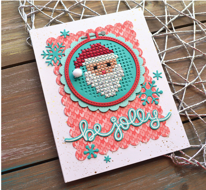
created for lawn fawn by chari moss

Pattern for Embroidery Hoop Lawn Cuts by Chari Moss